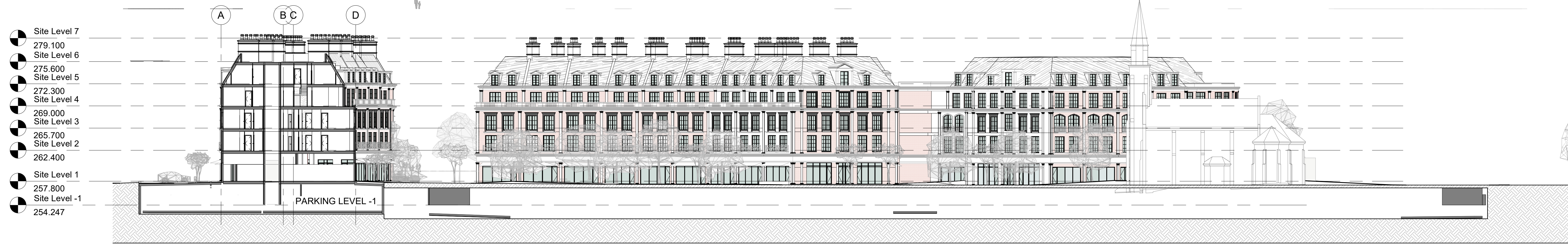
2 Site Section-02 A-301 1 : 300