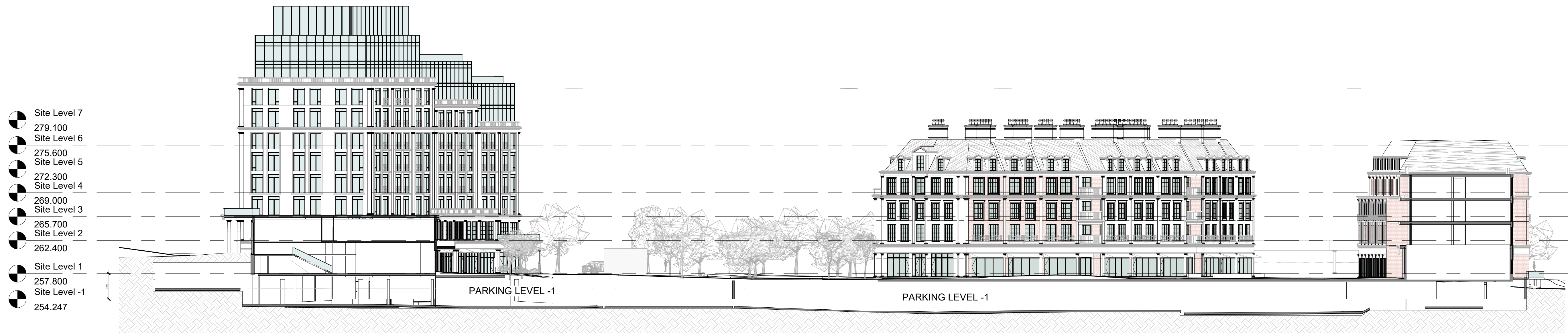
1 Site Section-01 A-301 1 : 300