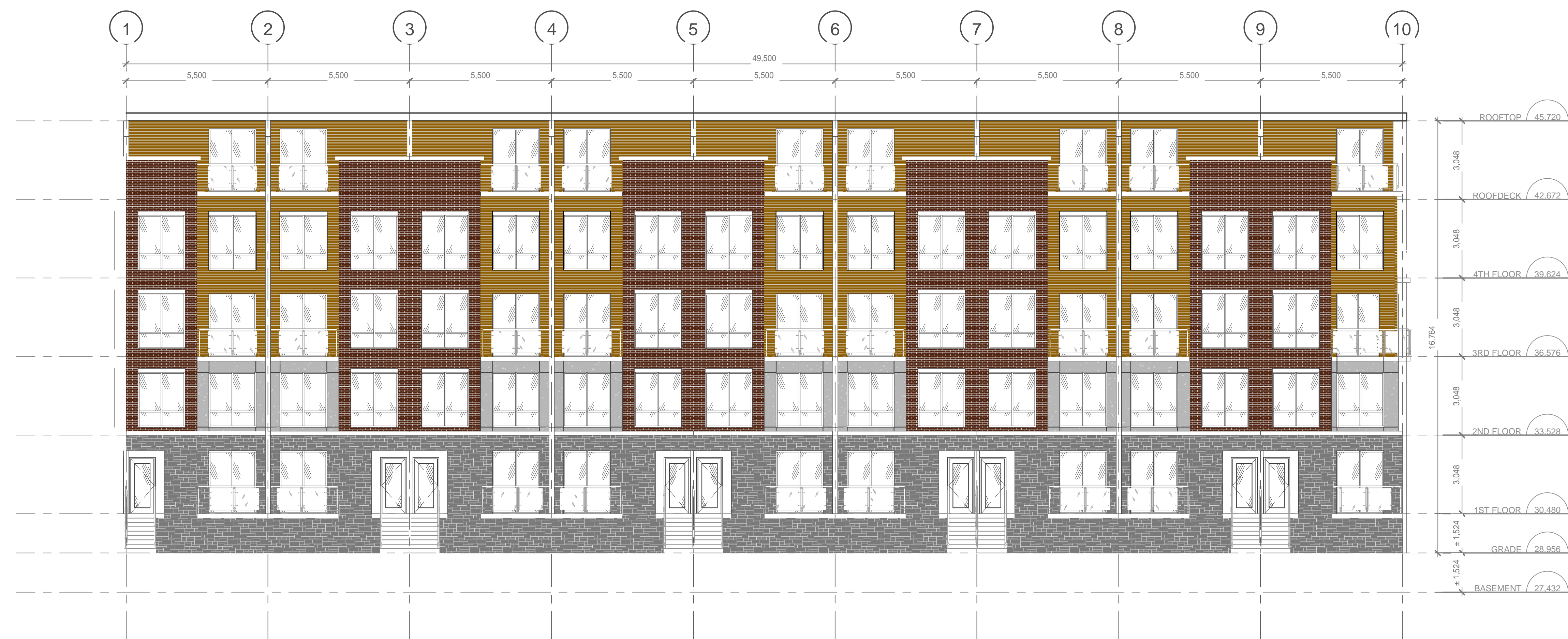
3 BUILDING D MAIN ELEVATION A2.0 1:100