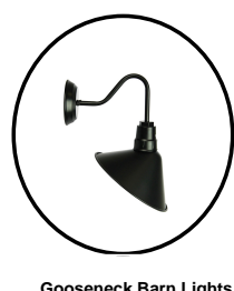
Gooseneck Barn Lights