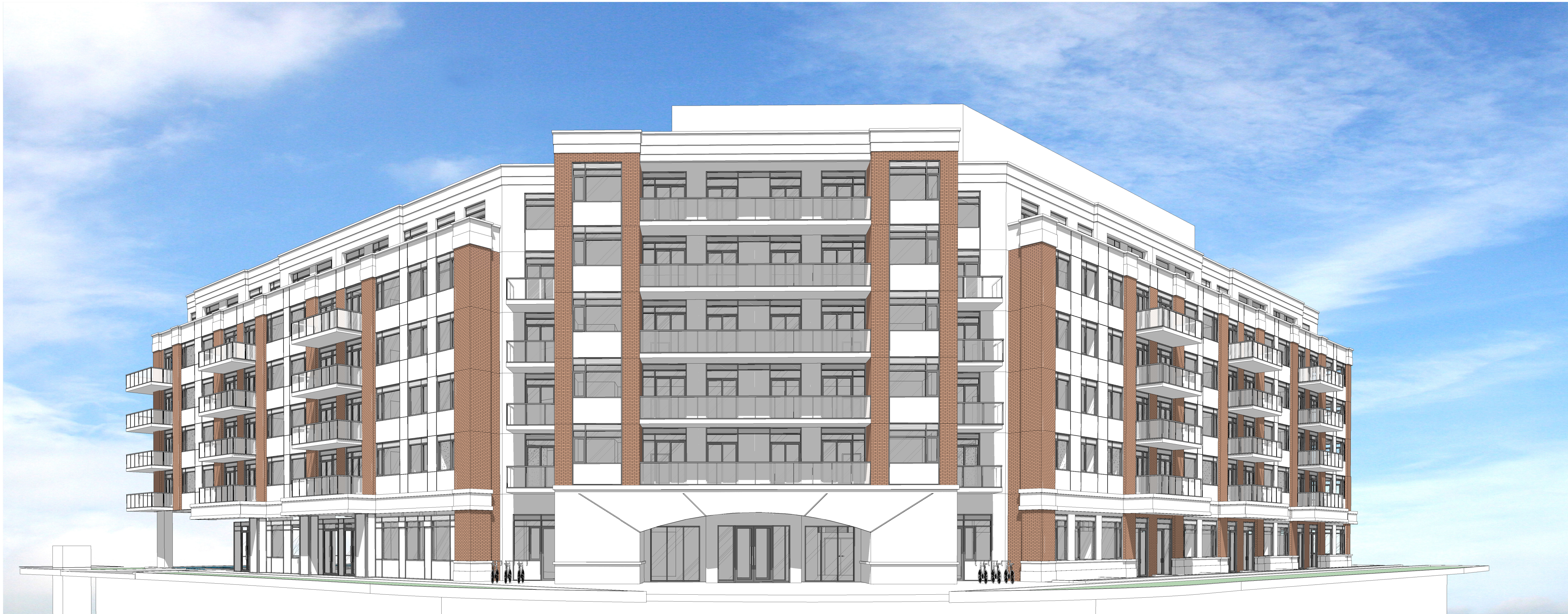
1 SOUTH EAST - ENTRANCE CORNER