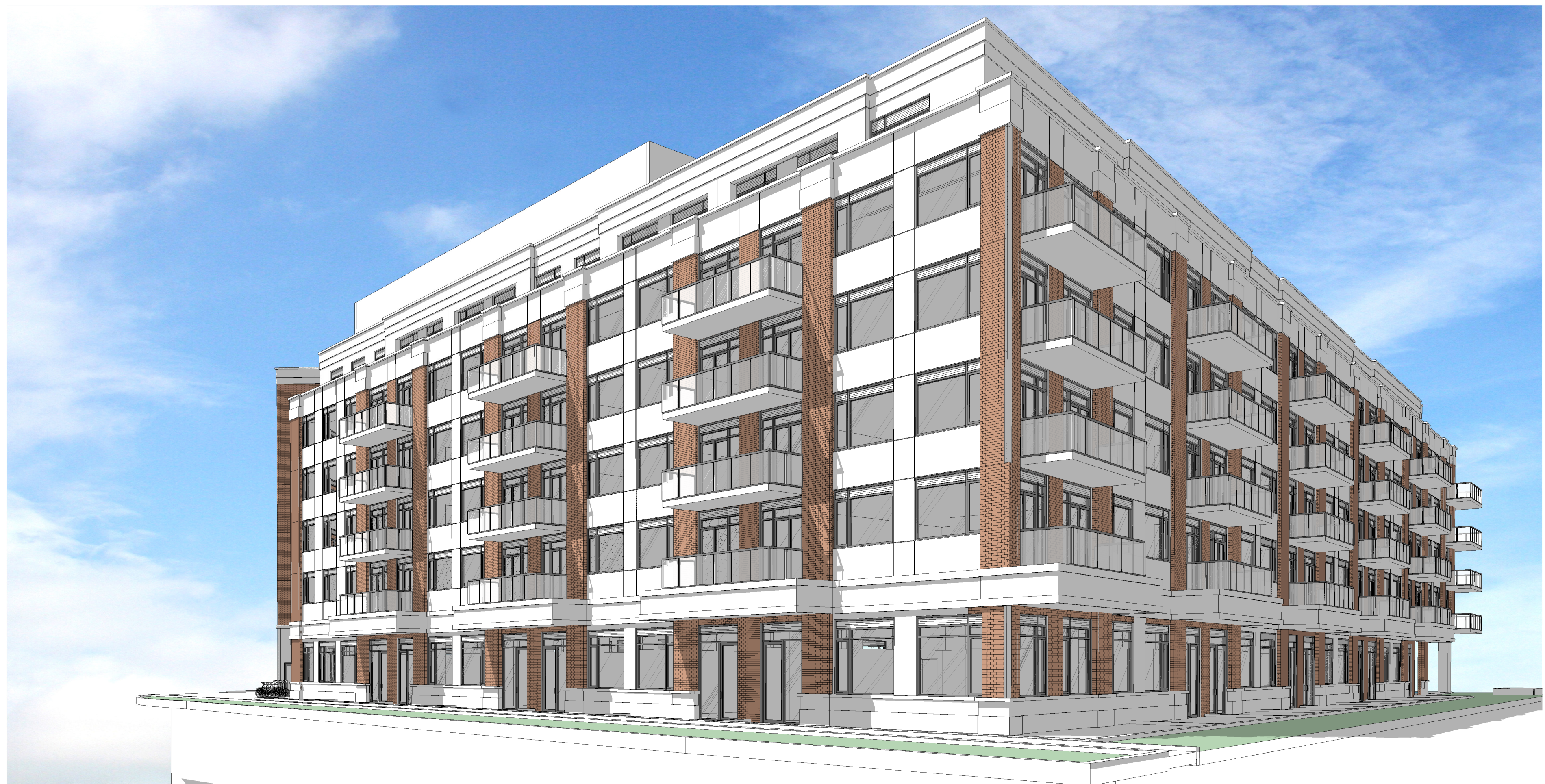
2 NORTH EAST CORNER