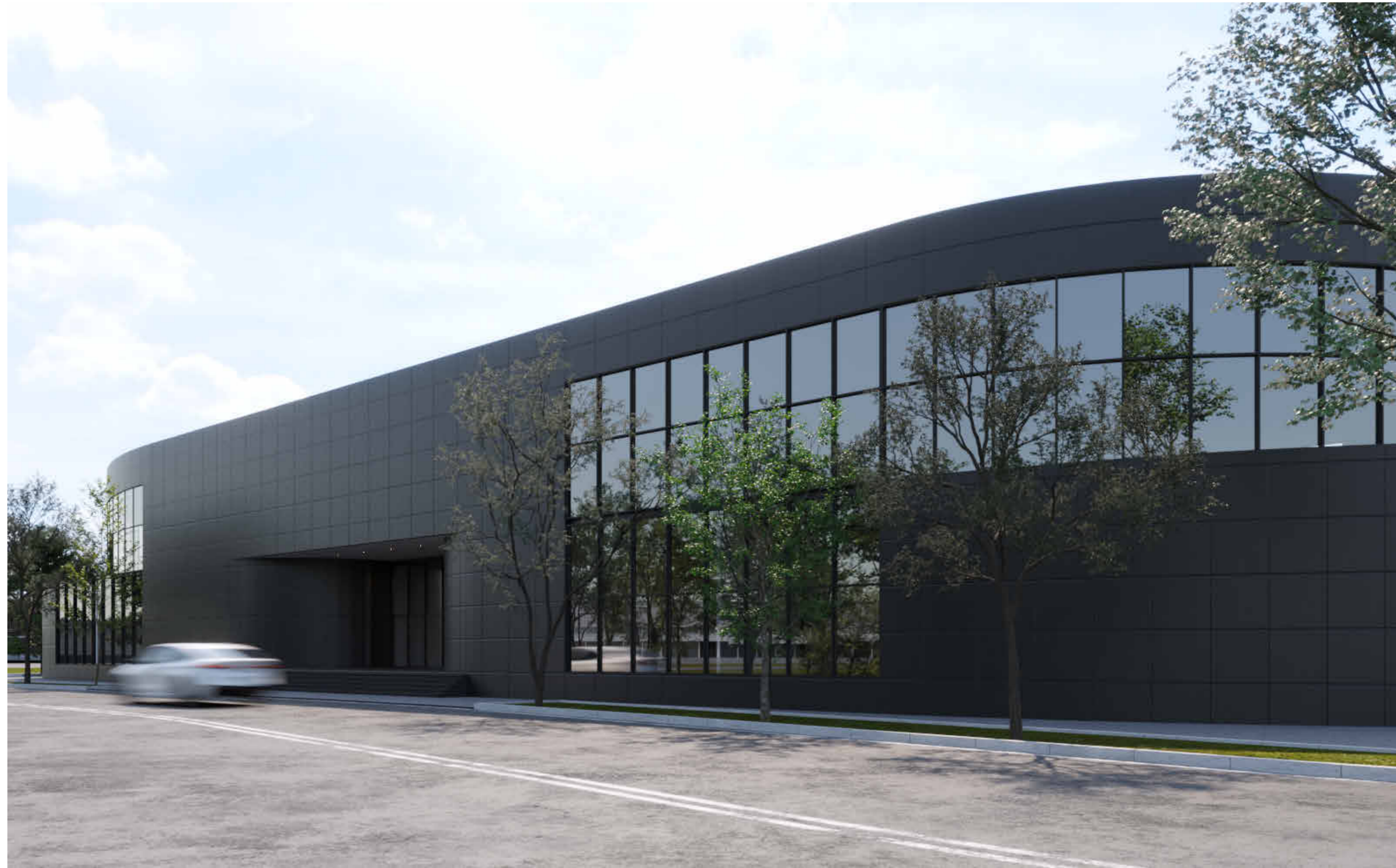
MAIN ENTRANCE - BATHURST STREET