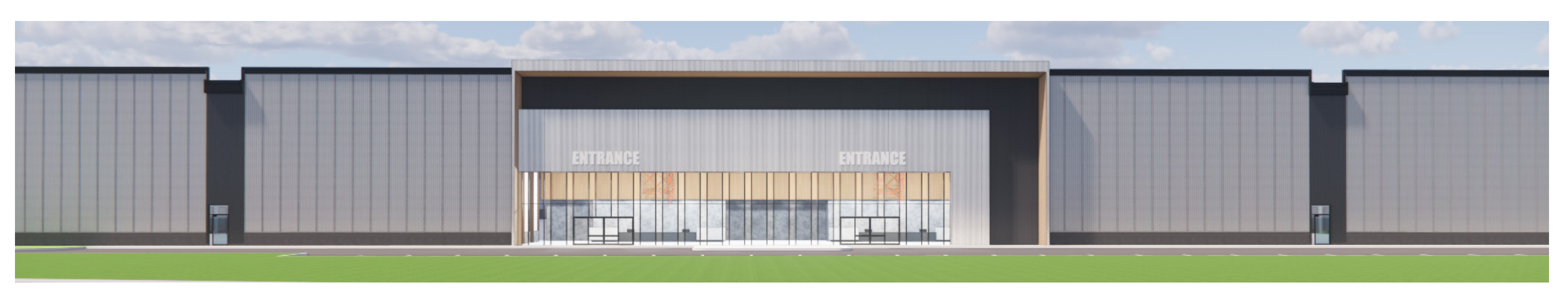
Office x Warehouse Elevation