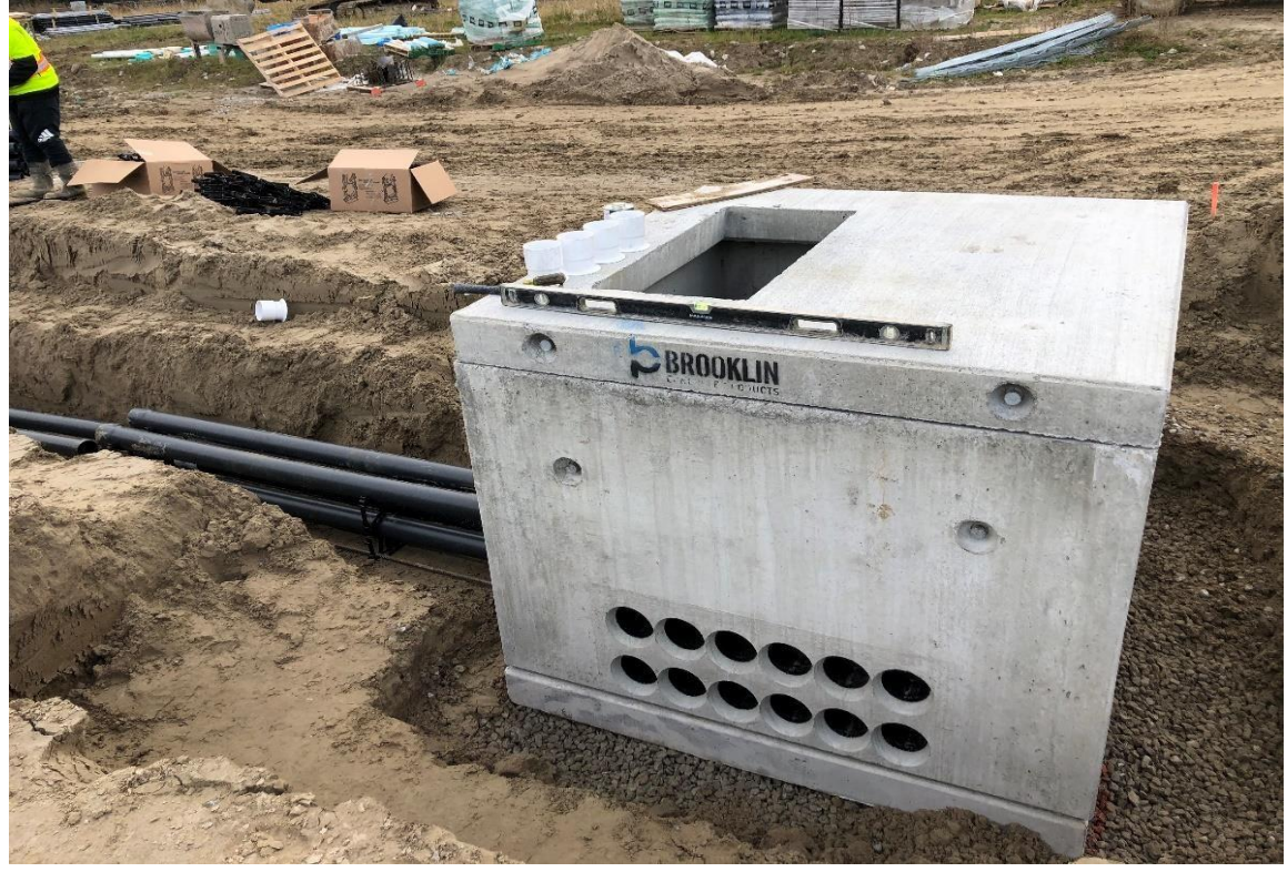
Transformer pad connecting primary and secondary duct banks