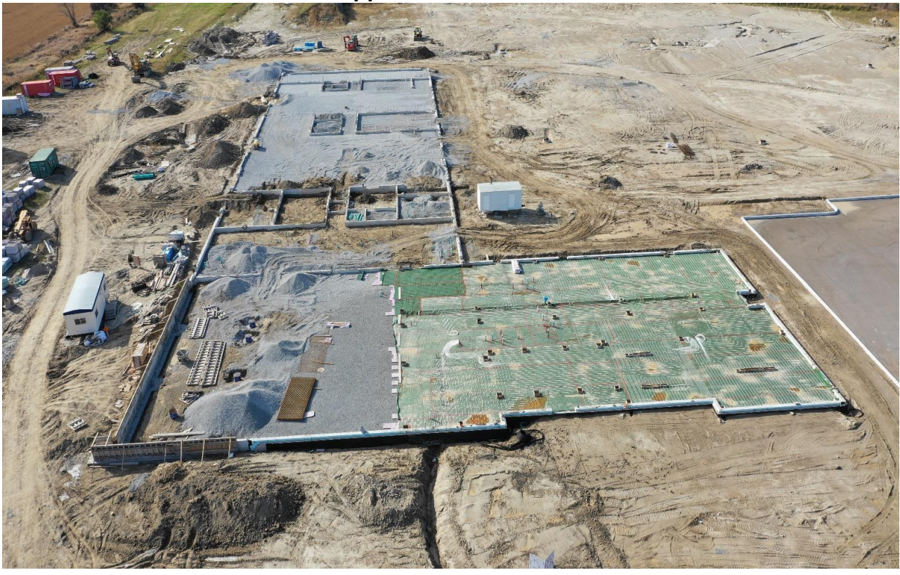
Aerial view looking west of foundation footprint October 2019