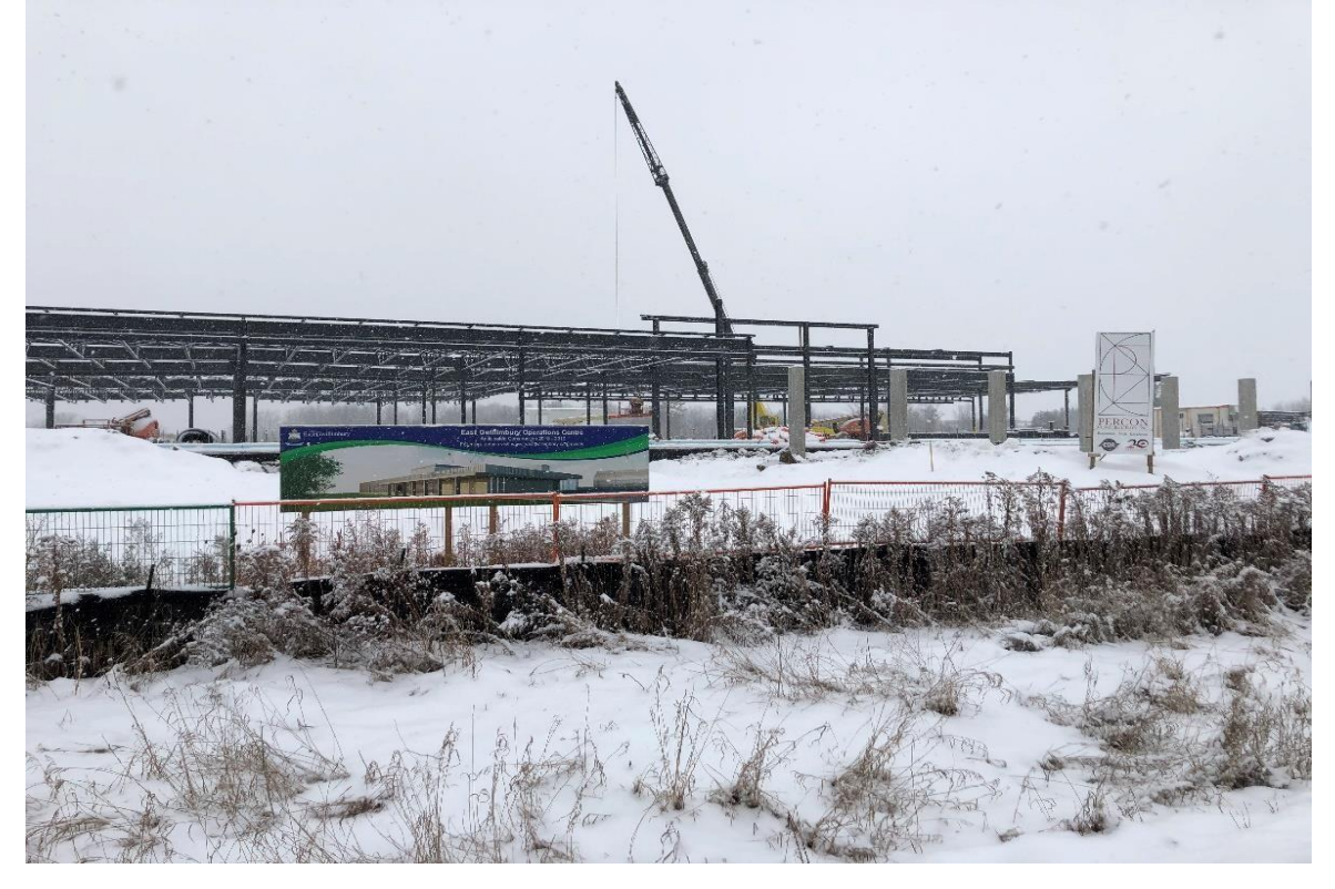
Facility east elevation view of structural steel