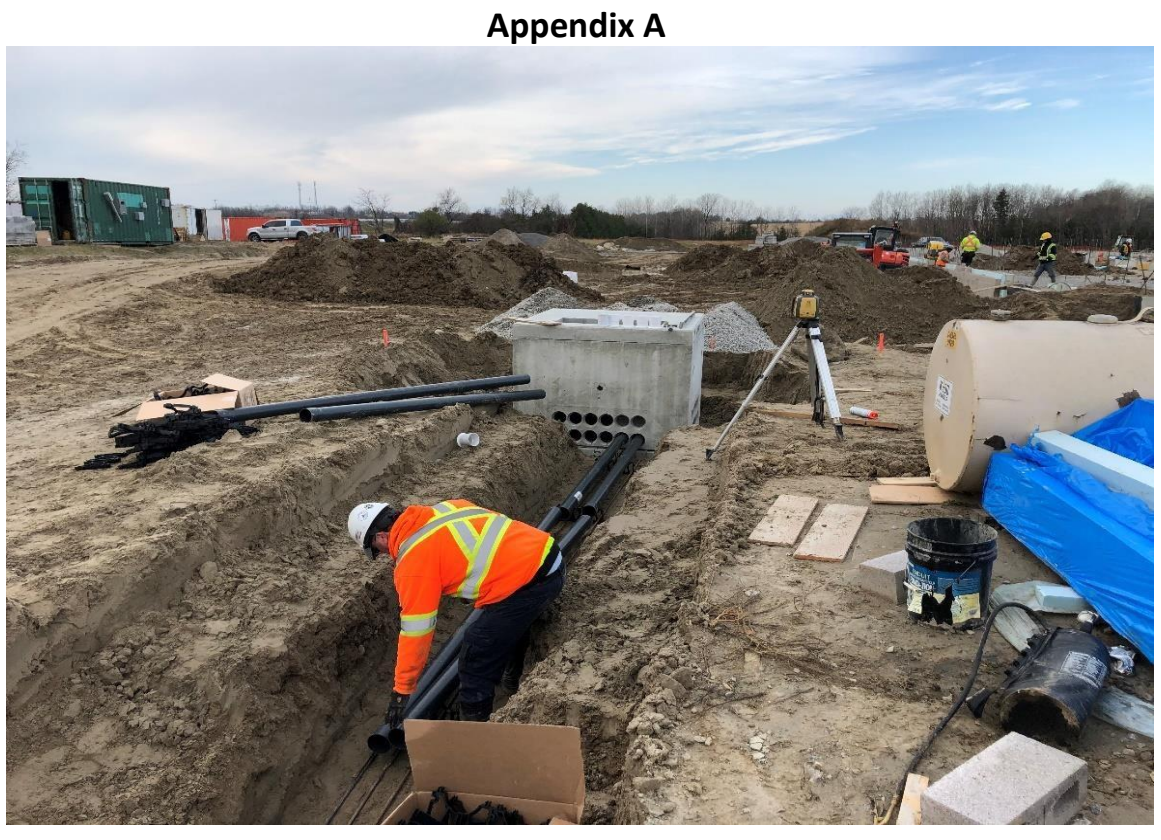
Installation of primary electrical duct bank to service facility