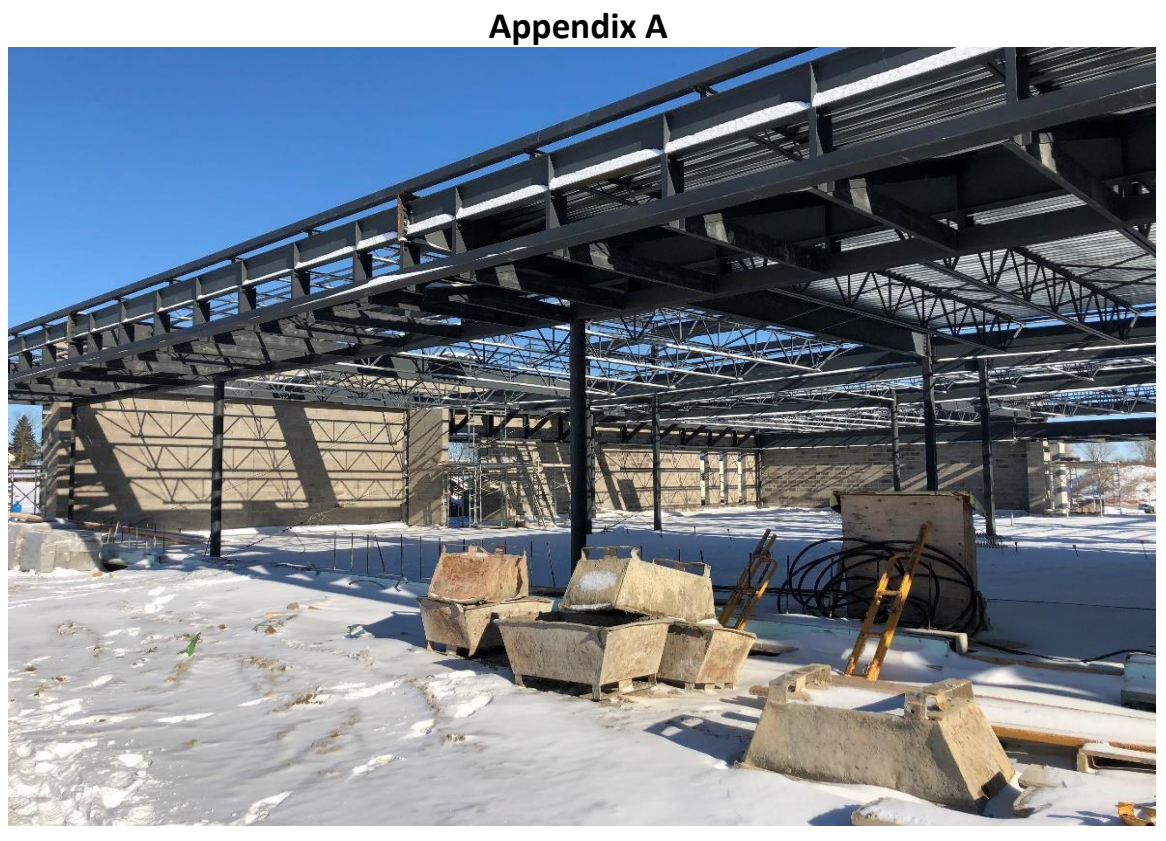
Steel columns, beams, trusses and decking along north administration area