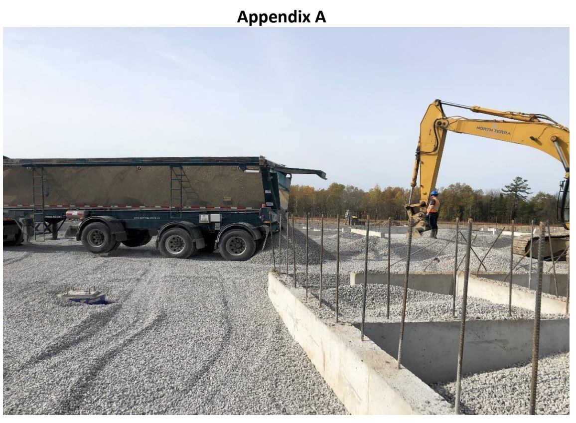
Placement of foundation stone service bays