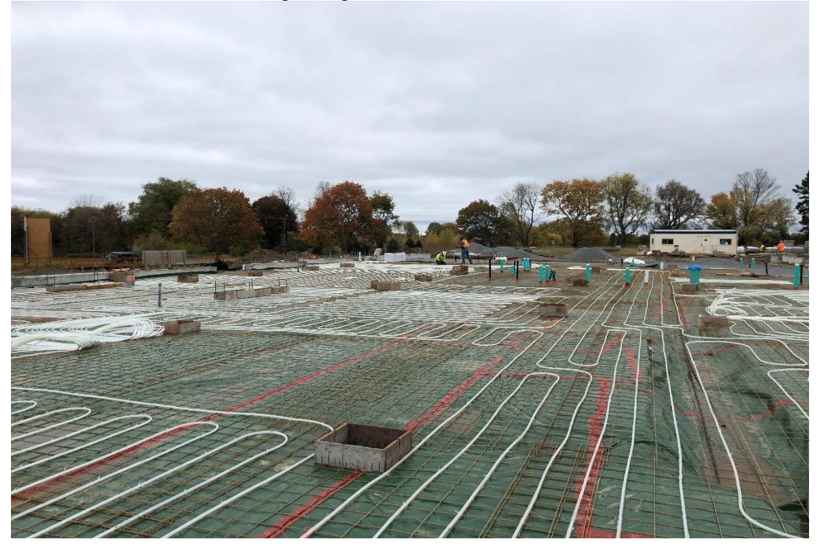
Underfloor heating along north elevation of administration area