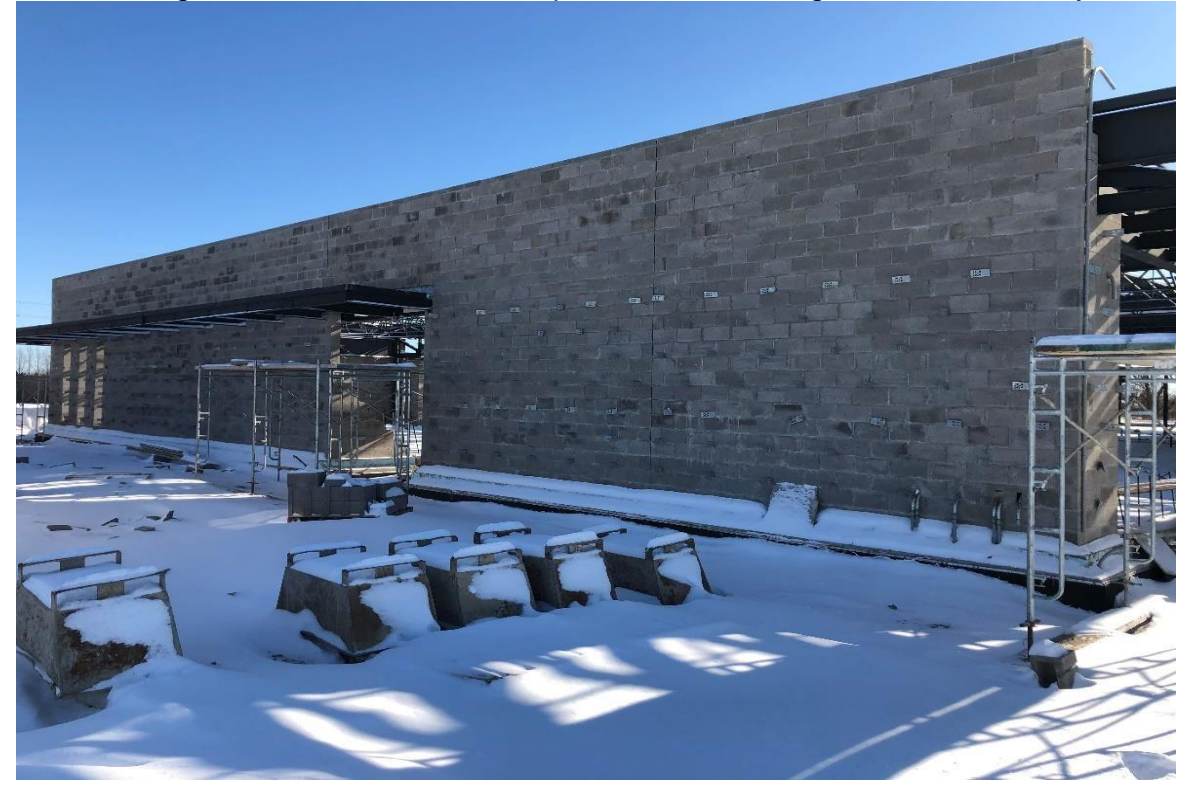
Masonry wall north elevation for EOC and lunch room