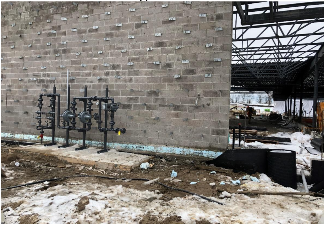
Enbridge Gas distribution station pad mounted along southern masonry wall