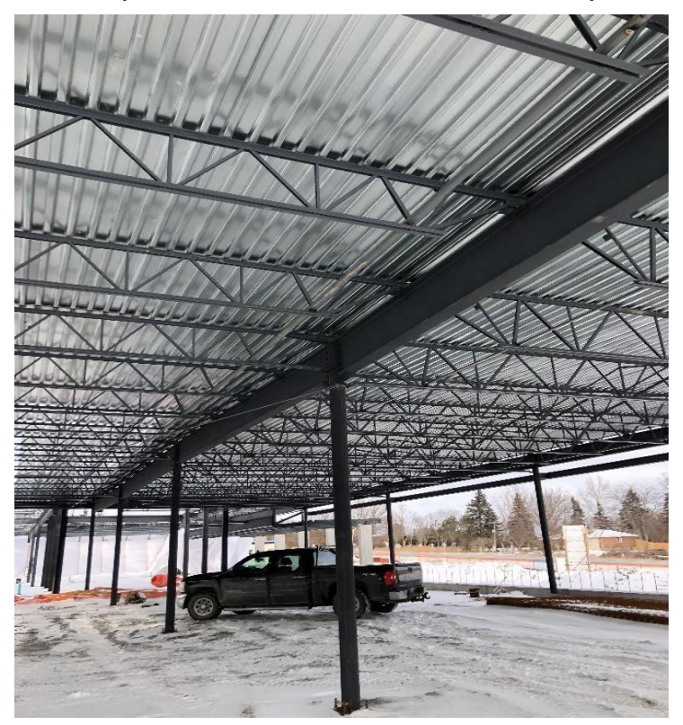
Steel decking placed, installed along administration area