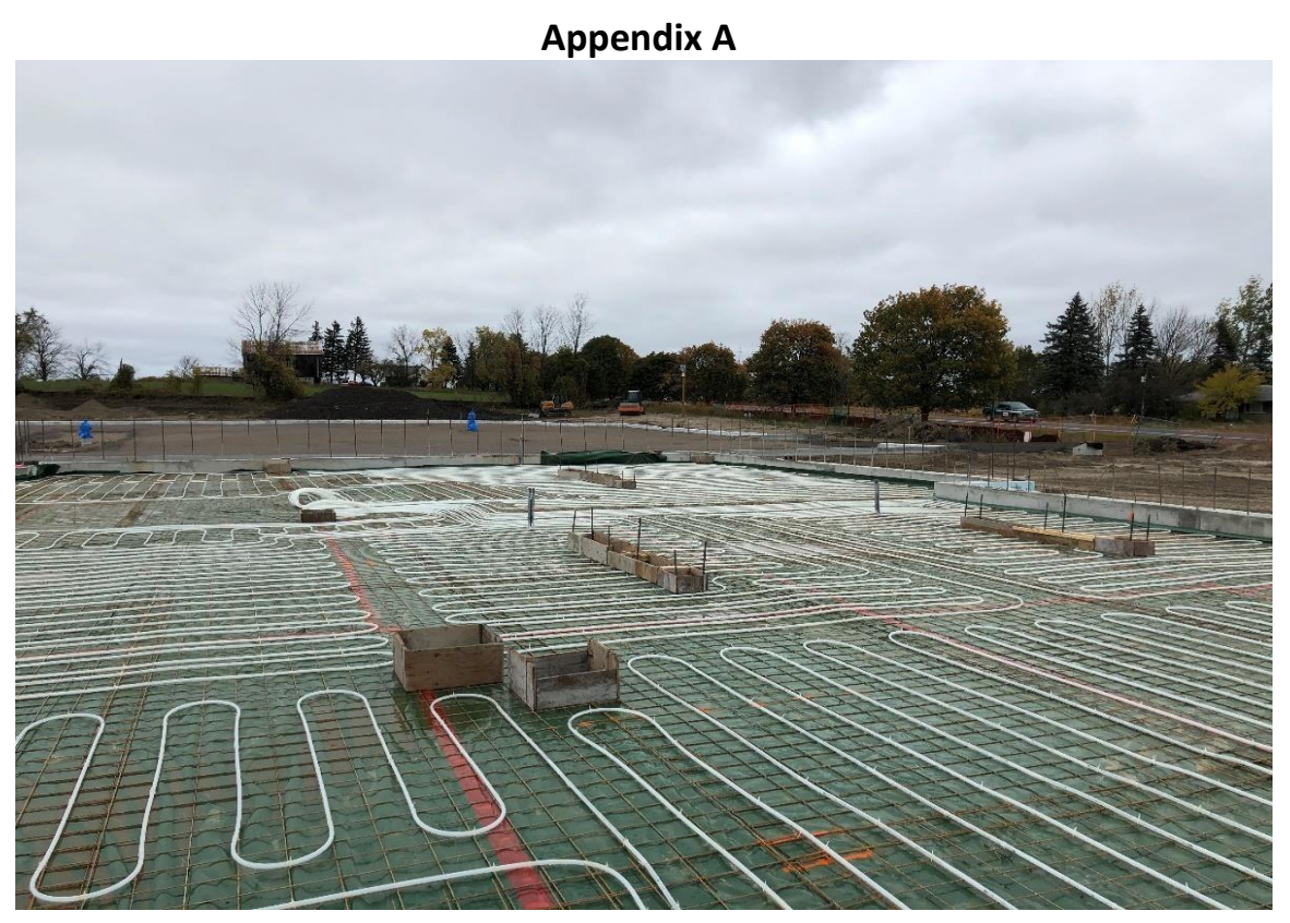
Underfloor heating along north elevation of administration area