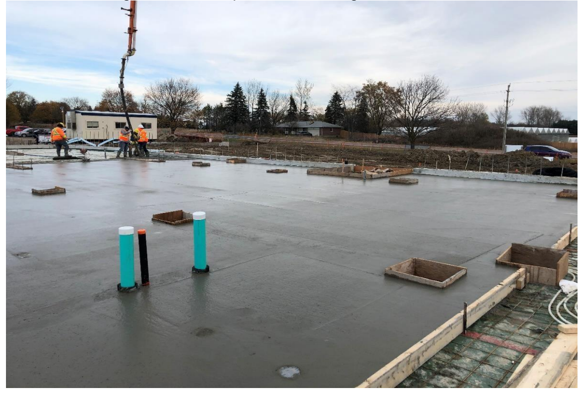
Slab on grade concrete pour EOC and administration meeting rooms