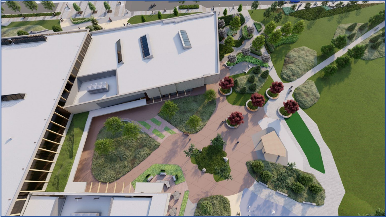
PHOTO 5 - Exterior Courtyard Plan View