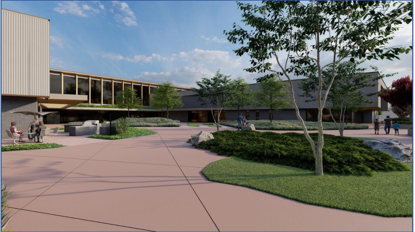
PHOTO 1 - Exterior Courtyard, Outdoor Kitchen, Outdoor Games & Seating Areas