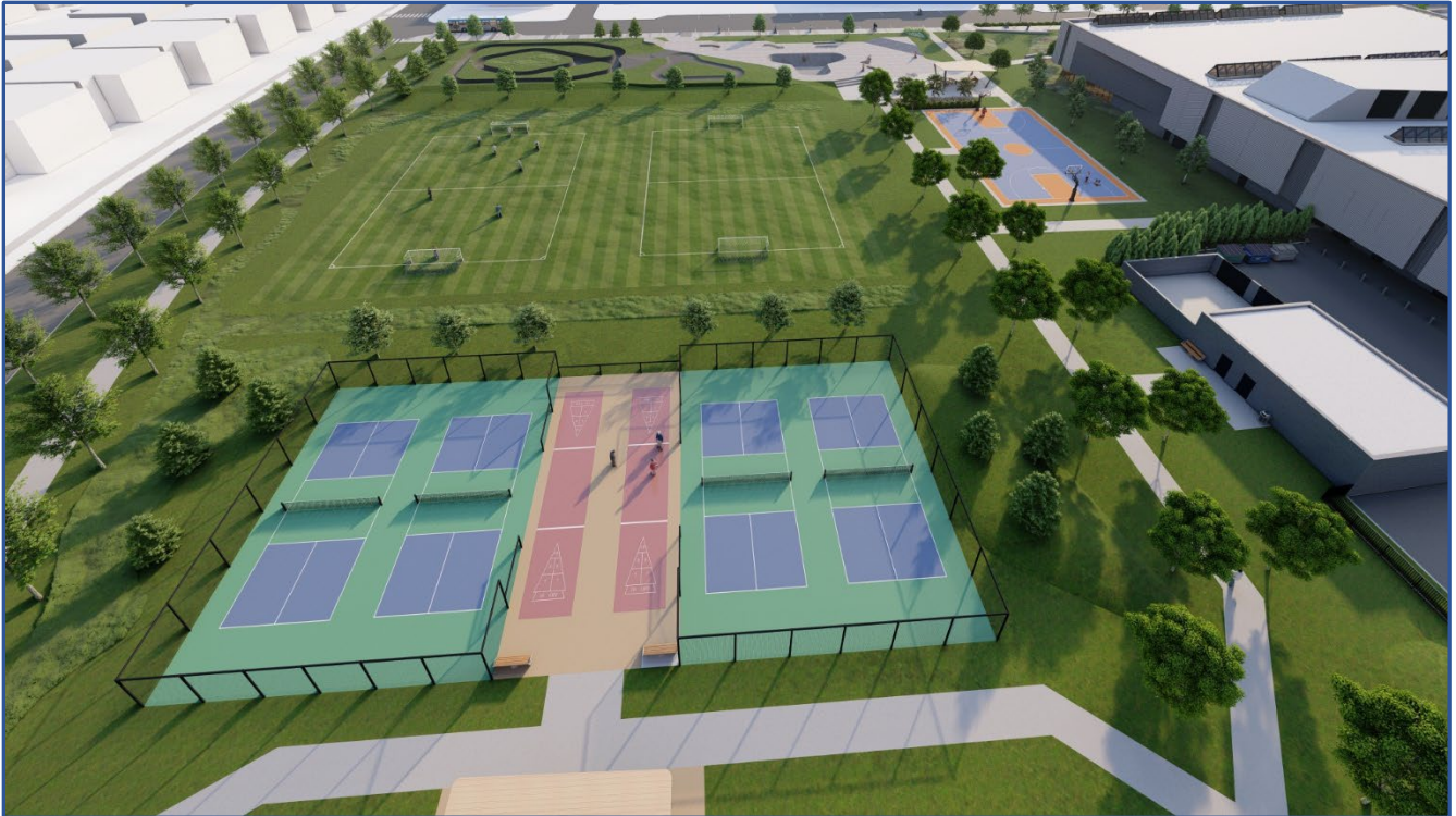
PHOTO 11 – Pickleball, Shuffleboard Courts and Junior Soccer Fields (East Facing)