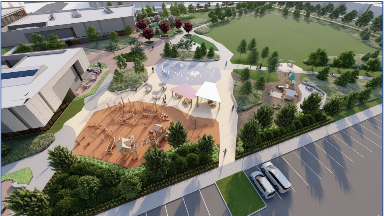
PHOTO 8 - Events Lawn, Playgrounds and Splash Pad Plan View