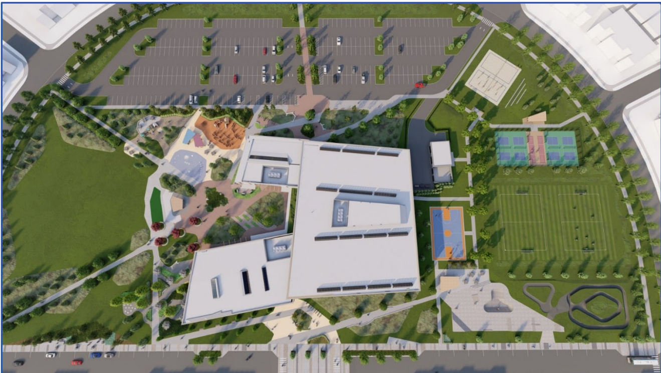
PHOTO 10 - Park Plan View