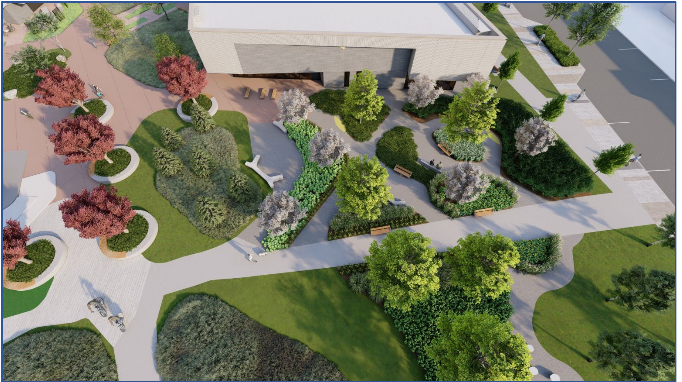
PHOTO 16 - Reading Garden Plan View