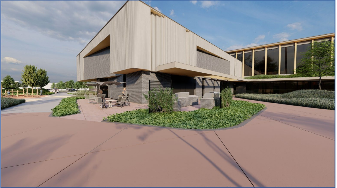
PHOTO 15 - Outdoor Kitchen