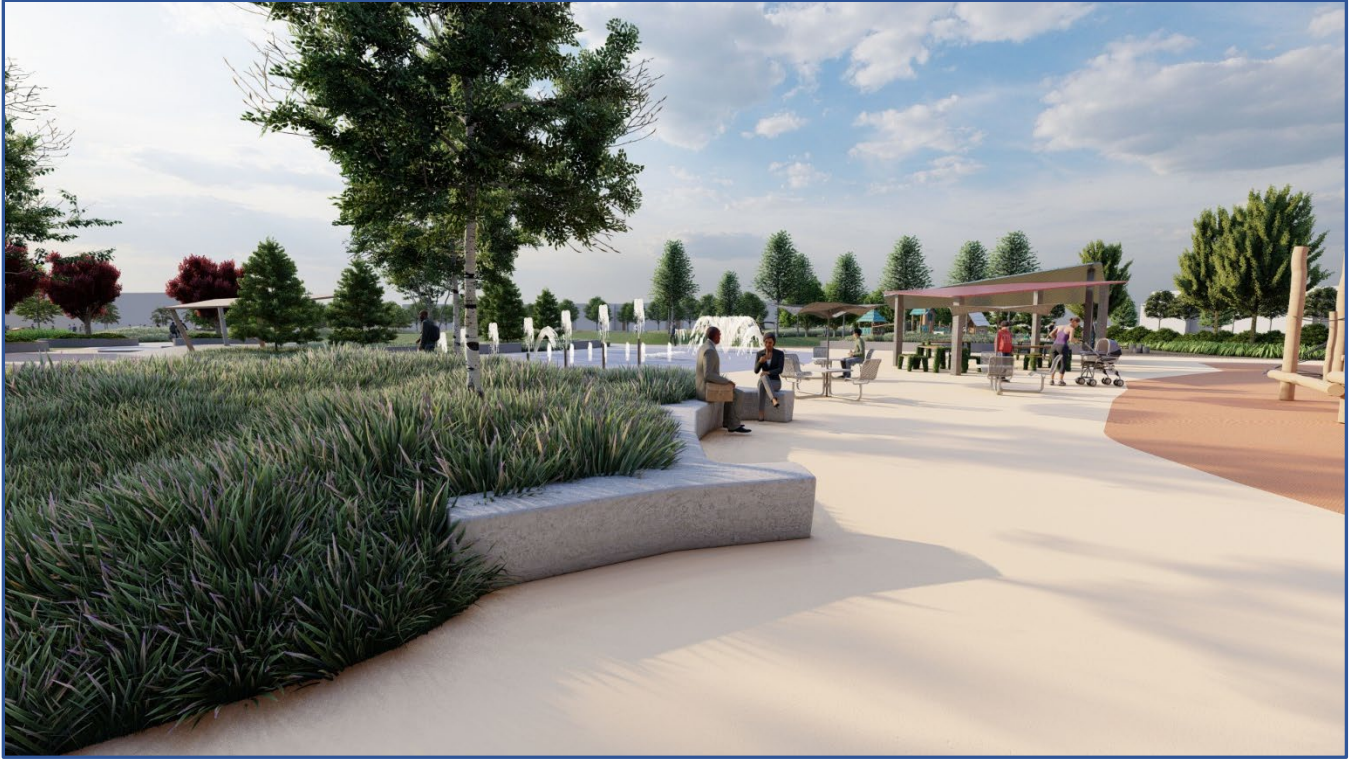
PHOTO 7 - Splash Pad, Playground and Shade Structure