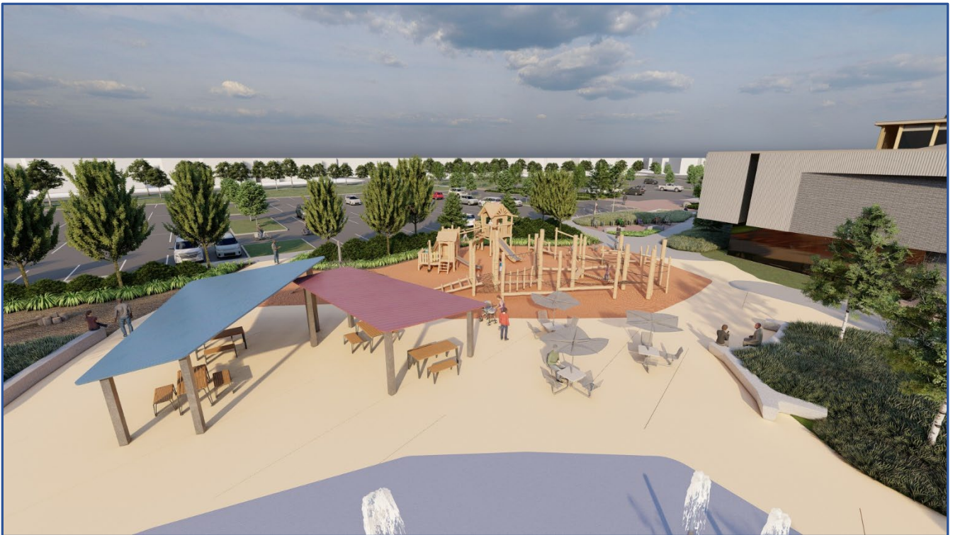
PHOTO 2 - Junior/Senior Playground, Shade Structure & Seating Areas