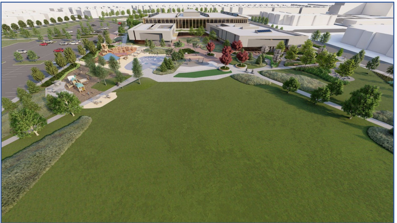
PHOTO 14 - Events Lawn with Amphitheatre Stage Feature (North Facing)