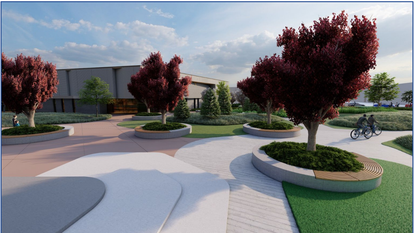
PHOTO 6 - Concrete Planters with Seating