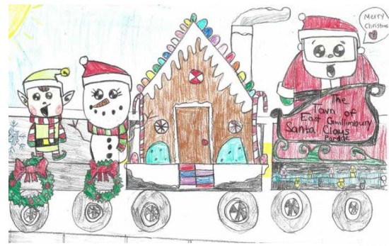
2019 holiday card winner

Participants can drop off their drawing in the drop-box at the front of the Civic Centre, or email it to communications@eastgwillimbury.ca . Participants should include the name, age of artist and contact information for a parent or guardian. One winner from each age group will be selected and the winner will receive a $100 gift card to a local business. The contest closes November 6, 2020.