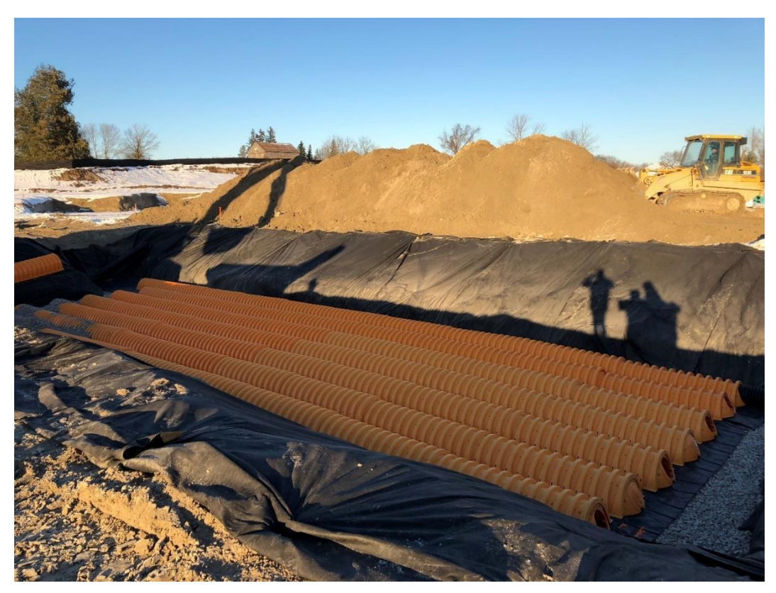
Site Servicing phase, installation of storm water infrastructure viewing North East