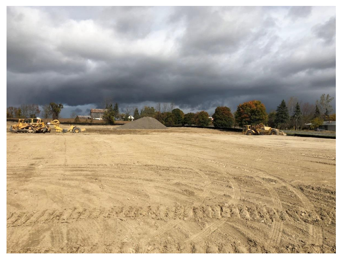
Grading and compaction of the future building site viewing North