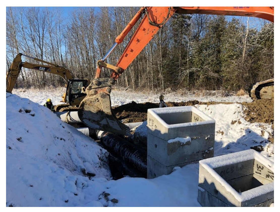
Installation of storm water infrastructure at rear storm water pond