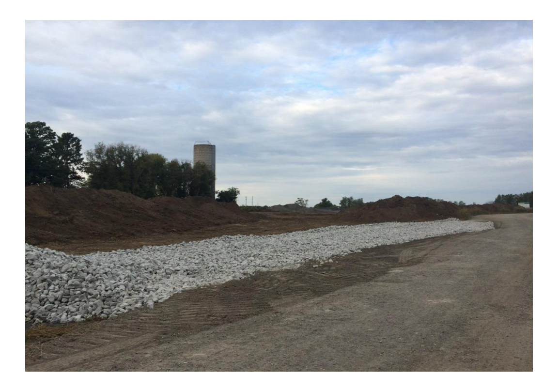
Construction entrance off Woodbine Avenue viewing West