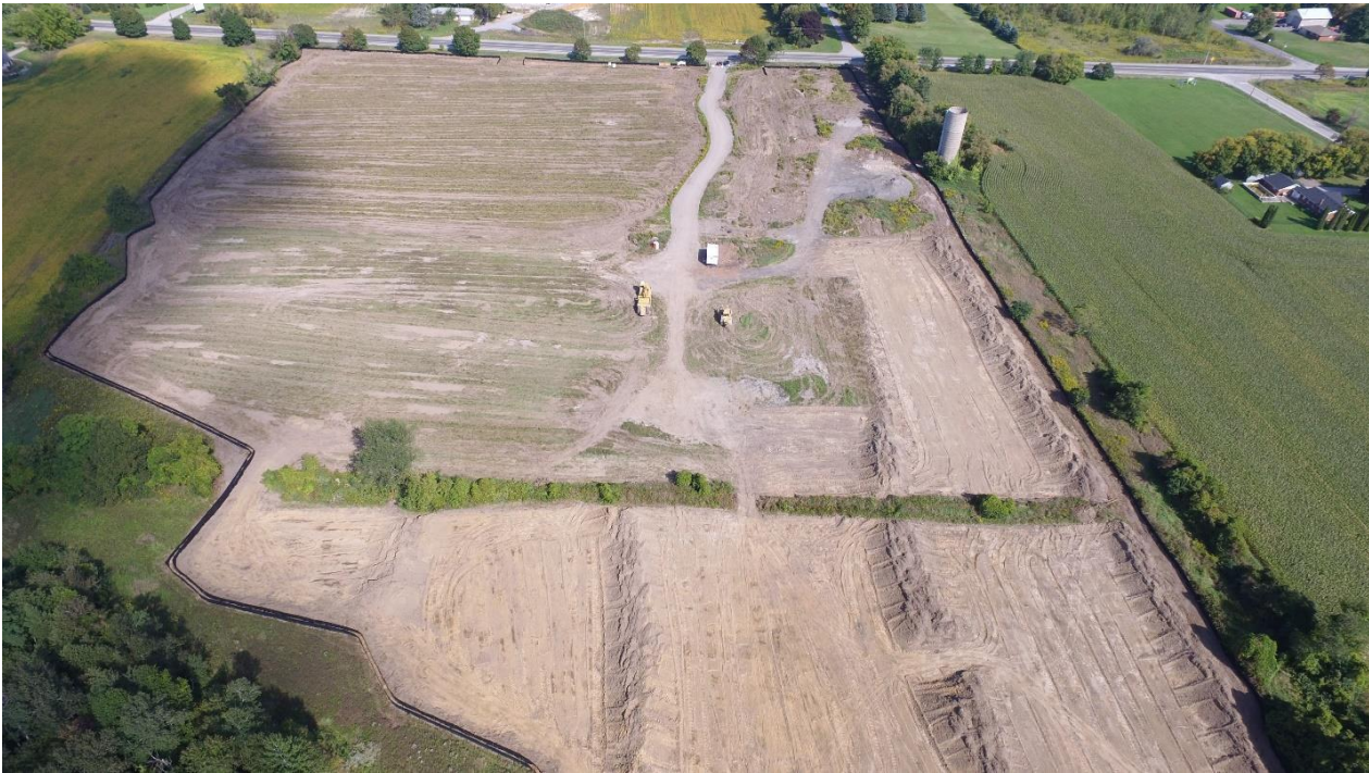
Viewing East, established silt/sediment control fencing, clearing, grubbing and removal of fill