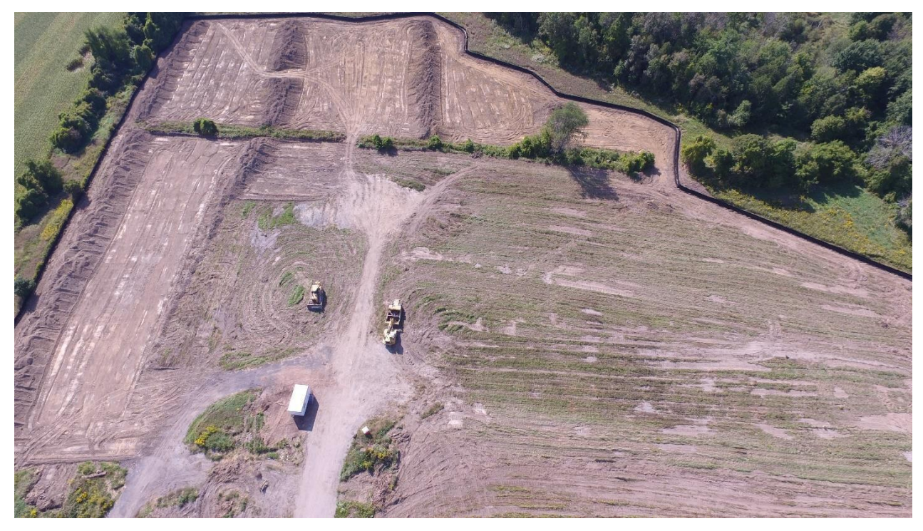
Viewing West, established silt/sediment control fencing, clearing, grubbing and removal of fill