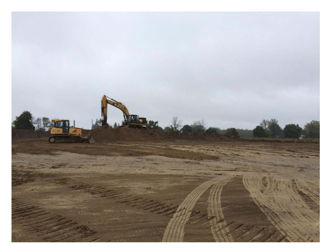
Removal of fill viewing North