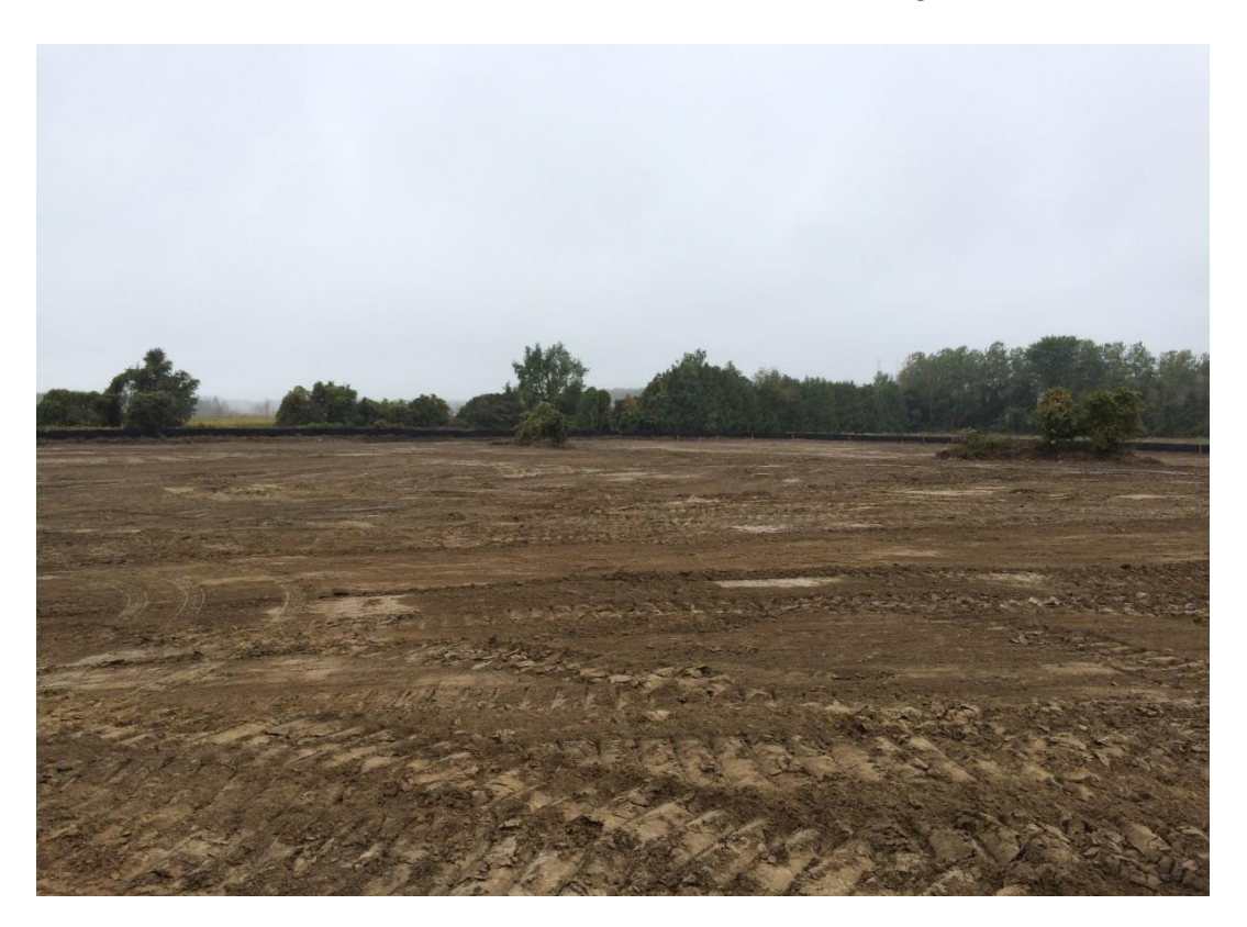
Grading and removal of fill viewing South