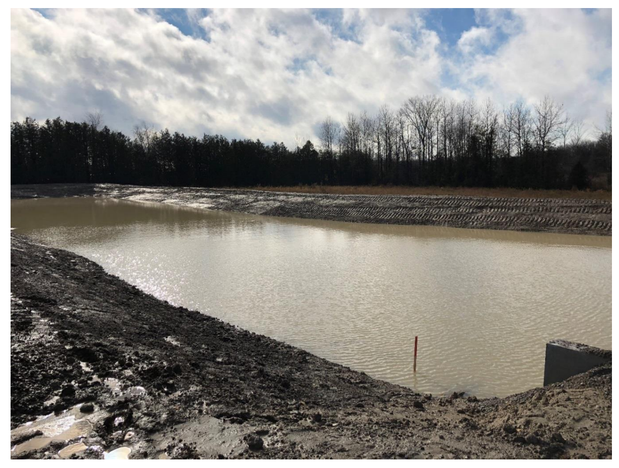
Storm water pond at rear of site viewing South West