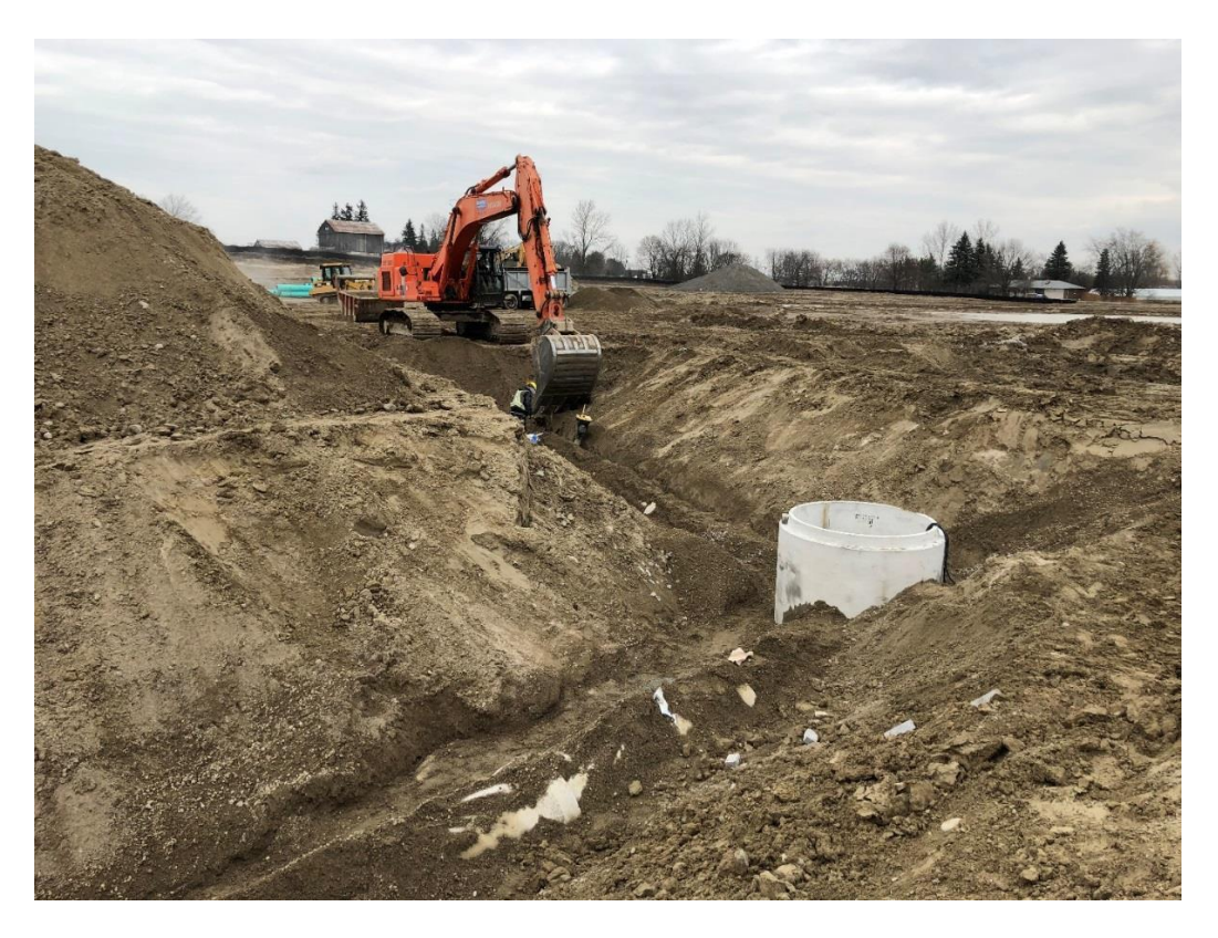
Site Servicing phase, installation of storm water infrastructure viewing North