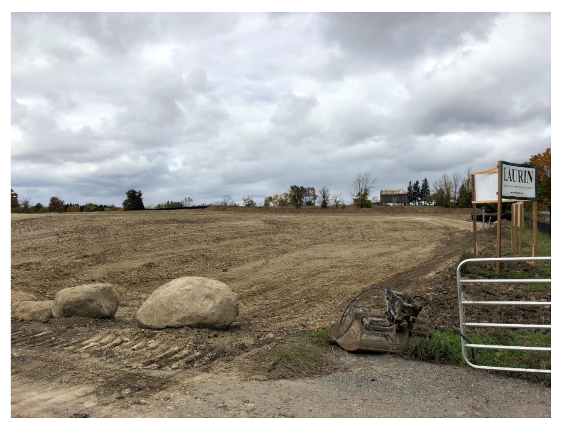
Construction entrance off Woodbine viewing North