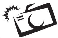
PHOTO CONTEST The judges are busy!

Response to our 2007 photo contest was well beyond our expectations. The judges are busy determining the finalists and will be posting further information shortly. Thank you for your overwhelming response.